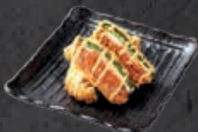
Stuffed Jalapeño Poppers

Sautéed Chicken with Onion, Mushroom in Spicy Teriyaki Sauce