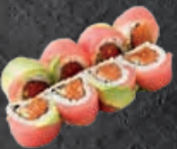
Red Dragon Spicy Tuna, Cucumber, Tuna, Avocado