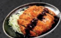
Cheese Pork Cutlet

Seasoned Pork Loin Stuffed with Cheese and Fried with Panko Bread Crumbs