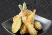
Shrimp & Vegetable Tempura

Spicy Tuna, Cream Cheese with Sriracha Aioli & Eel Sauce