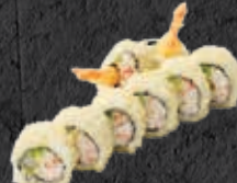
Crunch Roll Krabmeat, Shrimp Tempura, Cucumber, Avocado, Crunch Flakes