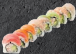
Rainbow Roll Krabmeat, Cucumber, Avocado, Tuna, Salmon, Shrimp, Albacore