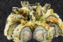
Tempura California (Baked Roll) Krabmeat, Cucumber, Avocado, Fried Seaweed