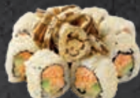
Mexican Roll Spicy Krabmeat, Avocado, Cucumber, Jalapeño, Crunch Flakes