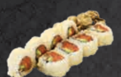
Heart Attack Roll Spicy Tuna, Avocado, Jalapeño, Crunch Flakes