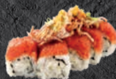
Sensual Pleasure Spicy Scallop, Cucumber, Spicy Tuna, Fried Onion