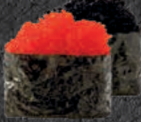
Tobiko (Red or Black)