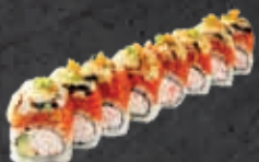
Vegas Roll Krabmeat, Avocado, Cucumber, Spicy Tuna, Fresh Water Eel Tempura