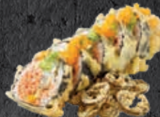
H.O.T Roll Spicy Tuna, Cream Cheese, Avocado, Jalapeño, Fried Jalapeño