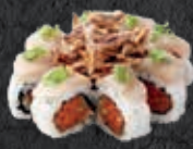
Albacore Lover Spicy Tuna, Cucumber, Albacore, Fried Onion