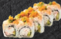
Alaskan Roll (Baked Roll) Krabmeat, Avocado, Baked Salmon