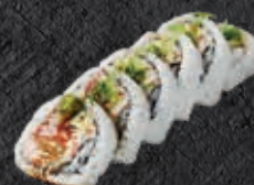
Sumo Roll Krabmeat, Tuna, Salmon, Yellowtail, Cucumber, Avocado