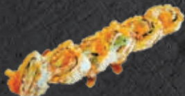
Jeffrey Roll (Fried Roll) Krabmeat, Avocado, Salmon, Green Onion, Masago, Eel sauce *No Rice