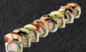
Black Dragon Krabmeat, Cucumber, Avocado, Fresh Water Eel