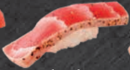
Seared Garlic Tuna