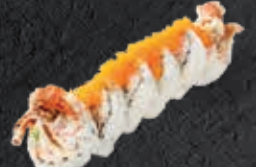
Spider Roll Krabmeat, Cucumber, Avocado, Soft Shell Crab, Kaiware, Gobo, Smelt Egg