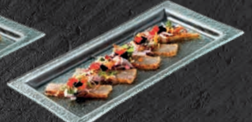
Spicy Albacore (4pcs)