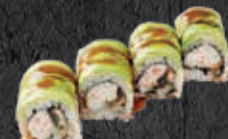
Caterpillar Roll Krabmeat, Fresh Water Eel, Cucumber, Avocado