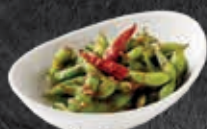
Garlic Chili Edamame

Soybeans Sautéed in Garlic Sauce with Chili