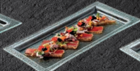
Seared Garlic Tuna (4pcs)