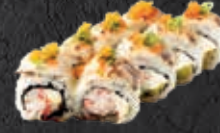
Snow Roll (Baked Roll) Avocado, Cream Cheese, Krabmeat, Baked Tilapia, Red Onion