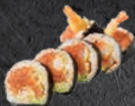
Rose Roll Spicy Tuna, Shrimp Tempura, Cucumber, Avocado