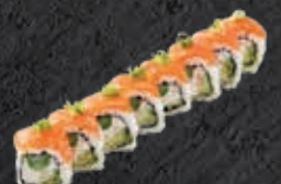
Ultimate Salmon Krabmeat, Asparagus, Avocado, Salmon