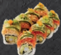
H2O Special Roll Asparagus, Shrimp Tempura, Spicy Tuna, Tuna, Shrimp, Avocado