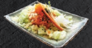
Spicy Tuna Salad

Thinly Sliced Cucumbers Marinated in Rice Vinegar Dressing