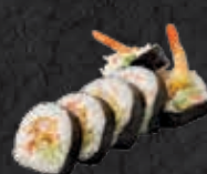
Tempura Roll Krabmeat, Shrimp Tempura, Cucumber, Avocado