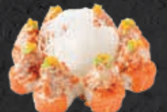
Mountain Roll Krabmeat, Avocado, Cucumber, Salmon, Spicy Tuna, Green Onion