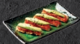
Spicy Tuna Crispy Rice

Fried Shrimp & Vegetable Served with Tempura Sauce