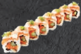
Washington Roll Spicy Tuna, Asparagus, Salmon, Sushi Ebi