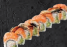
Tiger Roll Krabmeat, Avocado, Cucumber, Fresh Water Eel, Salmon