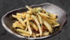
Furikake French Fries

Grilled Chicken with House Teriyaki Sauce